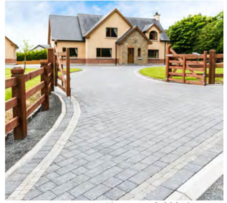
Kingspave Cobble Damson

Kingspave cobbled block paving collection captures the elegance of nostalgic old world charm. The block paving has a gently distressed surface to achieve a natural weathered appearance.