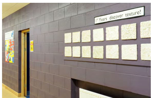
Trinity Airtight Block Directly Decorated

High quality and economical, Barleystone Trinity Airtight masonry blocks have a fine textured surface, tight dimensional tolerances, and sharp, clean arises, ready to be painted on directly.